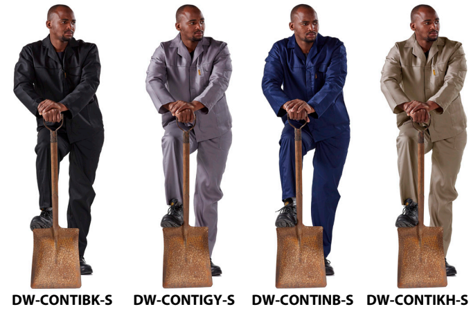
DW-CONTIBK-S DW-CONTIGY-S DW-CONTINB-S DW-CONTIKH-S

Style: Long sleeve jacket and pants suit. Fabric composition: 80% Polyester 20% Cotton. Mass: 200gsm.