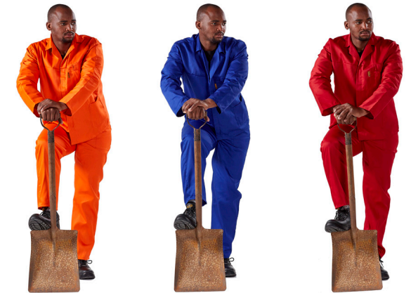
DW-CONTIOR-S DW-CONTIRB-S DW-CONTIRD-S