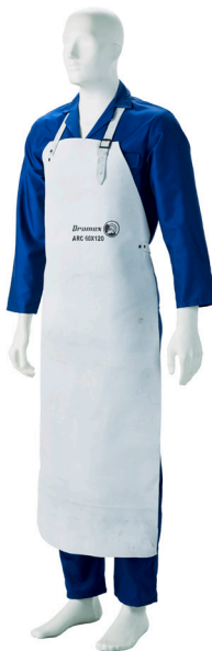
ACE ONE 60X120