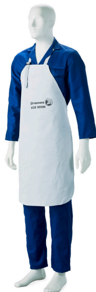
ACE ONE 60X90